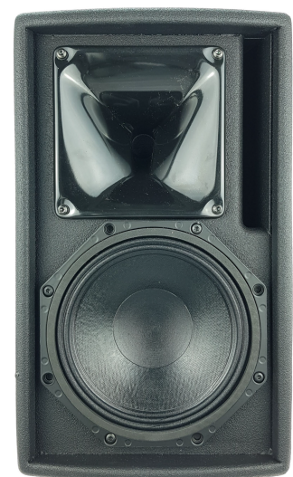
Grille removed, the large PS horn used with the HF driver

ePS8-EN54 acoustic phase response is NEXO phase signature allowing interoperability between all NEXO speakers at all crossover points, except for the monitor setups where latency is minimized.