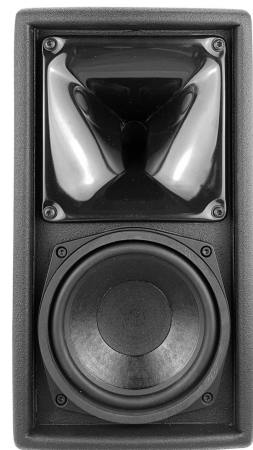
Grille removed, the large PS horn used with the HF driver

ePS6-EN54 acoustic phase response is NEXO phase signature allowing interoperability between all NEXO speakers at all crossover points, except for the monitor setups where latency is minimized.