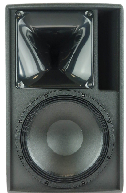
Grille removed, the large PS horn used with the HF driver

ePS12-EN54 acoustic phase response is NEXO phase signature allowing inter-operability between all NEXO speakers at all crossover points, except for the monitor setups where latency is minimized.