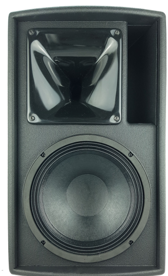
Grille removed, the large PS horn used with the HF driver

ePS10-EN54 acoustic phase response is NEXO phase signature allowing inter-operability between all NEXO speakers at all crossover points, except for the monitor setups where latency is minimized.