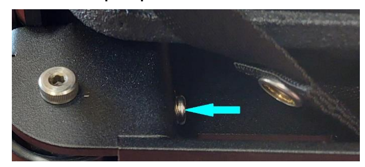
For first-time use, remove the protective strip of Velcro tape from the back of the cover.