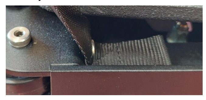
Fold back the front panel