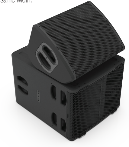
A P12 stacked on top of a L15 offers and extremely compact yet efficient drum fill.

A dedicated minimum latency setup is also available, compatible with the minimum latency monitor setups of the P12. The result is a very efficient drum-fill system, both cabinet sharing the same width.