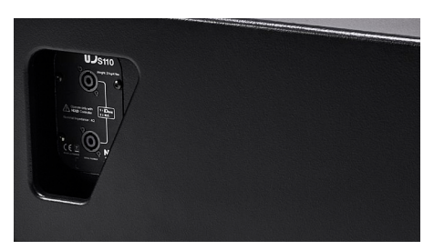
Rear panel connectivity / Touring version