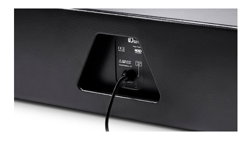
Rear panel connectivity / Installation version

IDS110 and IDS210 subs share the same phase response as other NEXO speakers, making them extremely easy to integrate in ID Series systems or systems using other NEXO modules.