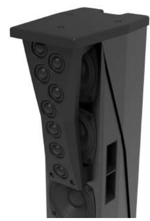
The patent pending HF arrangement coupled with the electronic steering offers +0/-10° or +0/-25° vertical directivity.

The ID84 shares the same phase response as other NEXO speakers, making it extremely easy to mix with all NEXO systems, e.g for side fill or front fill, or when used with any NEXO subs, without risk of comb filtering or requiring complex electronic adjustment.