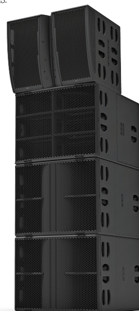
Typical Alpha+ system with 2x L20 subs, 1x B218 bass and 1x M210 main module, all powered by a unique NXAMP4x4mk2.

A particular care has been taken also to adjust the group delay of the Alpha+ system ensuring a tight sound over the whole spectrum while keeping the ease of use of interoperability with other NEXO products.